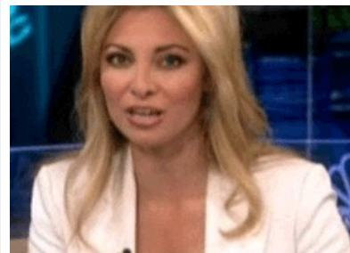
GOOGLE BANNED THIS VIDEO

Lodging packages and discounts are priced lower if purchased before the resort opens. It pays to call early.